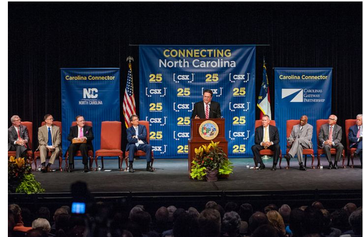
Rocky Mount site announcement