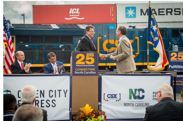
Announcing the Queen City Express